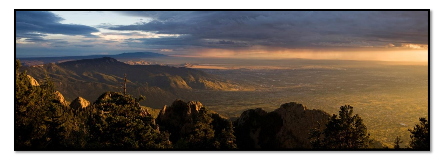
Goal Five: Make family caregiving easier through coordination of care