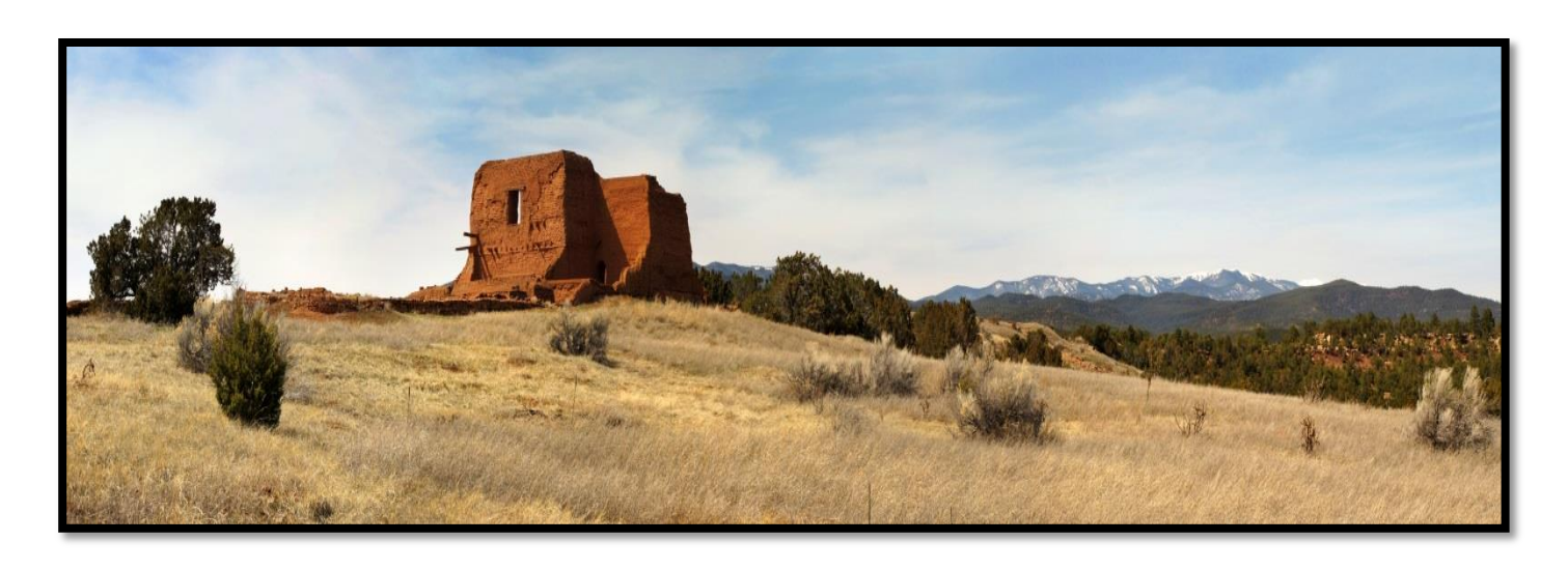
Goal Six: Ensure support for family caregivers who work