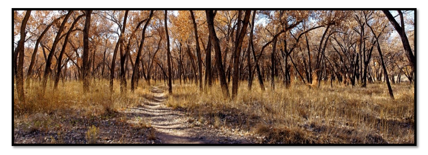
Goal One: Ensure that family caregivers access the resources they need