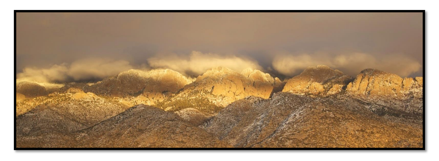
Goal Four: Ensure that family caregivers are supported