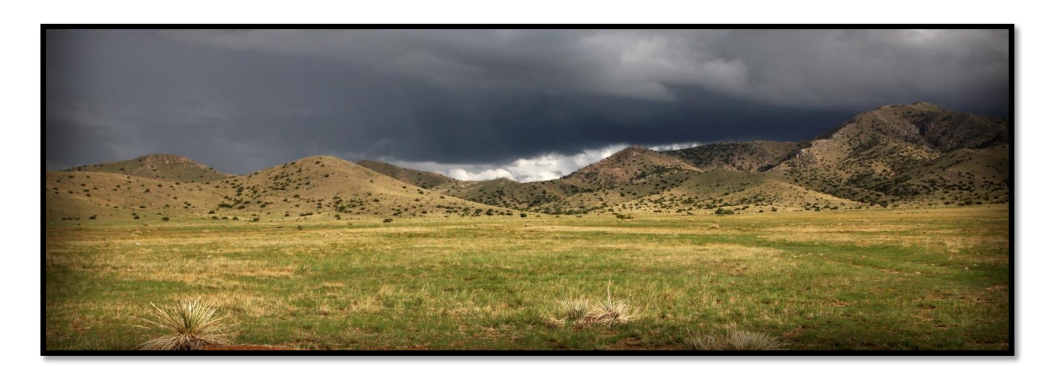
Goal Seven: Ensure that family caregivers access respite