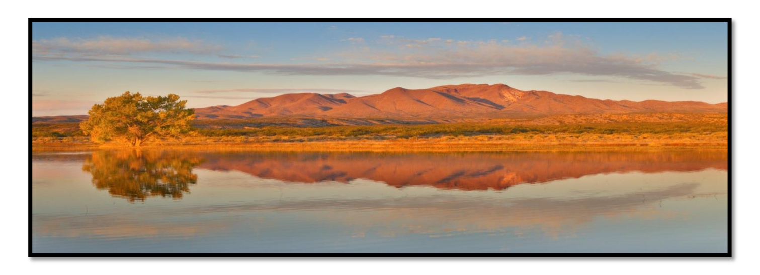
Goal Three: Limit future caregiver burden