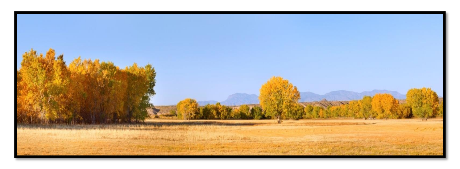
Goal Two: Ensure that family caregivers are properly trained